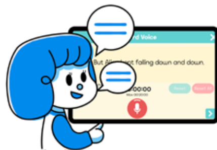
② Press the subtitle.