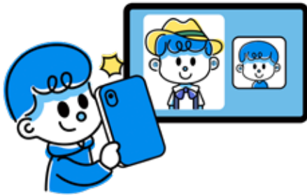
① Make your own face character in StorySelf.

Become a main character in the storybook