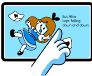
③ Record your voice for the subtitle.