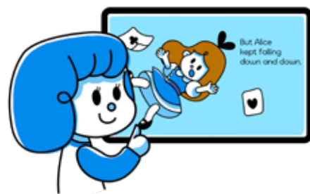
④ Enjoy your voice in the storybook.