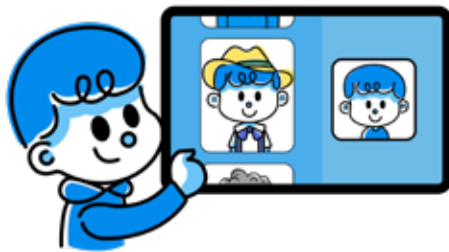
③ Choose your face character.